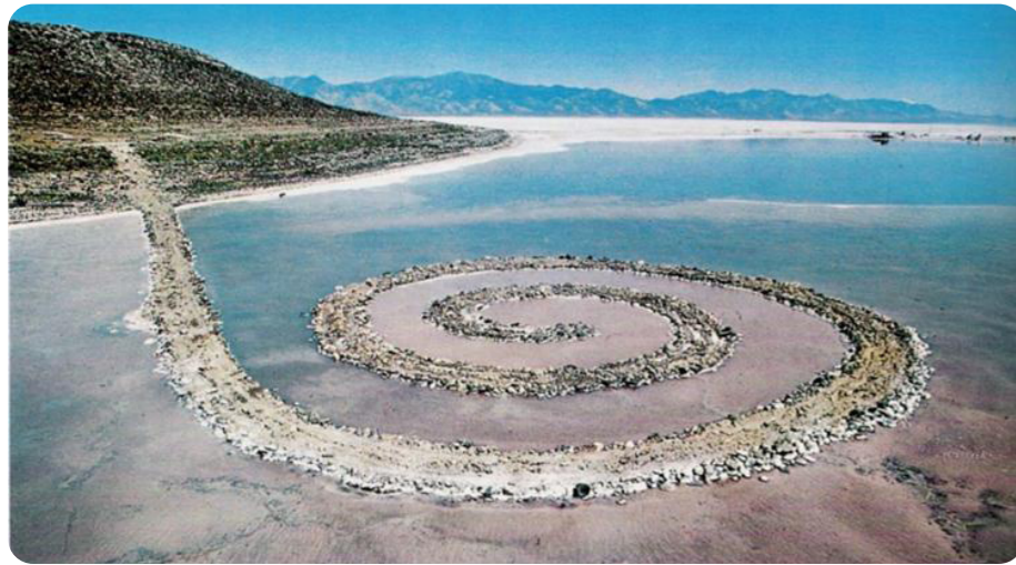
Spiral Jetty by Robert Smithson, 1970

Land art, or Earth art, is art that is made within the landscape. Land art is usually captured using photography because it is temporary and often made on a large scale.