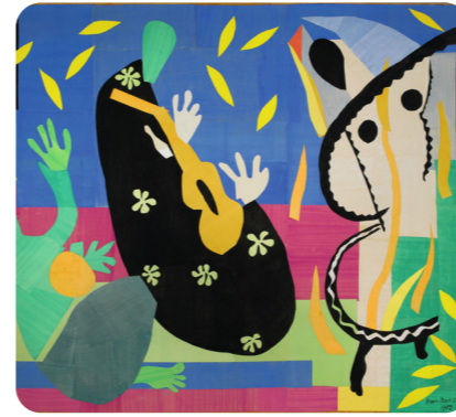
Sorrow of the King by Henri Matisse, 1952

Paper collages are made by gluing different types of paper to a background. The paper used to make a collage can be torn, folded, crumpled or layered to create interesting textural effects. Henri Matisse is well known for his collage art.