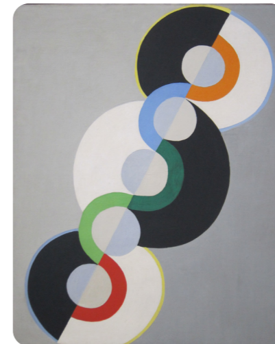
This painting, by Robert Delaunay, is called Endless Rhythm . It represents the movement of music through endlessly connected circles and loops.

Orphism was an abstract painting style developed by married artists Robert and Sonia Delaunay around 1912. It was based on Cubism but pioneered a new emphasis on bright colours and abstract shapes to create energy and movement.