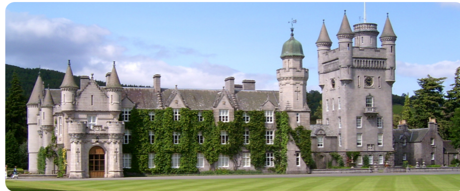
Balmoral Castle is in Aberdeenshire, Scotland. It is used mainly as a holiday home for the Royal Family.