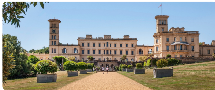
Osborne House is on the Isle of Wight, England. This was Queen Victoria's favourite holiday home.