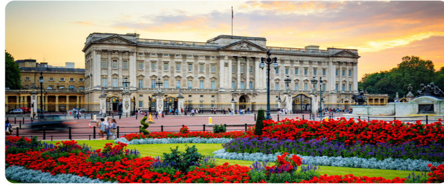
Buckingham Palace is in London, England. It is the Queen's main residence.

Royal residences include palaces, castles and stately homes. Some of them are used for official royal business and some are used as holiday or private homes.