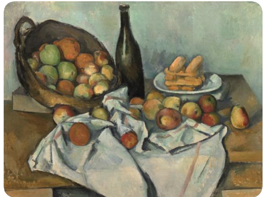
The Basket of Apples by Paul Cézanne, 1893-1895

A still life is an artwork showing an arrangement of everyday objects. Paul Cézanne and Vincent van Gogh are famous still life artists.