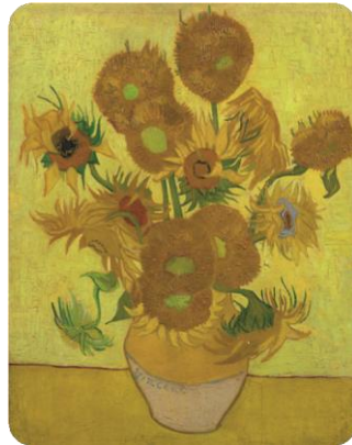
Vase with Fifteen Sunflowers by Vincent van Gogh, 1888