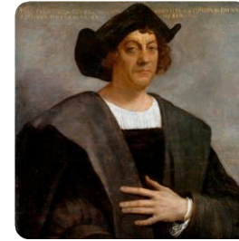
Christopher Columbus -first European to find America.