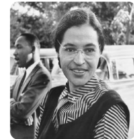
Rosa Parks wanted black people to have the same rights as white people.