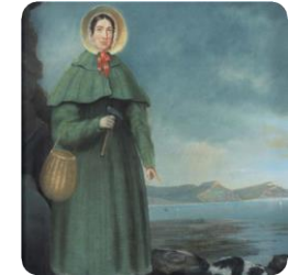
Mary Anning – studied fossils a shard her knowledge.