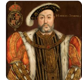
Henry VIII – was the king who formed the church of England.