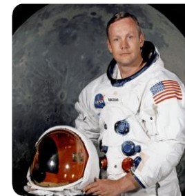
Neil Armstrong - first man to walk on the moon.