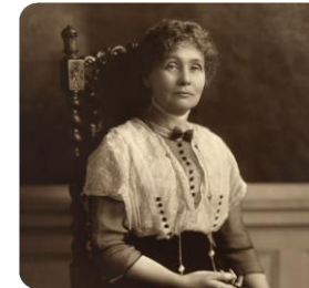
Emmeline Pankhurst – stood up for women's rights.