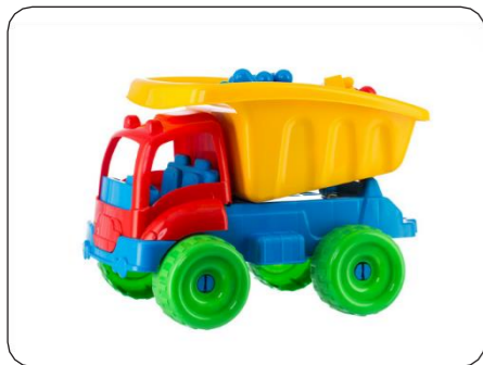
This toy is made from plastic.