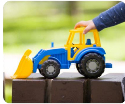
A plastic toy is hard and smooth.