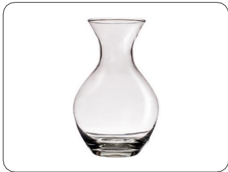
This vase is made from glass.

Materials are what objects are made from. Examples of materials include glass, wood, fabric, plastic, stone and metal.