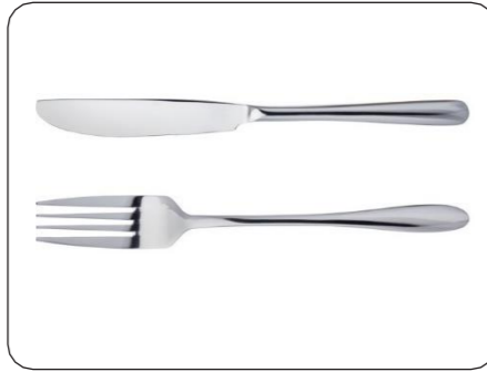
This cutlery is made from metal.