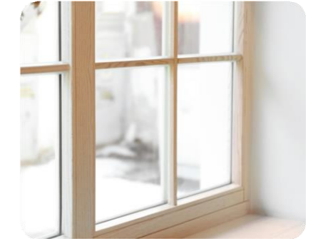
A glass window is hard and transparent.