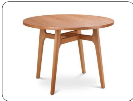
This table is made from wood.