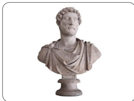
This statue is made from stone.