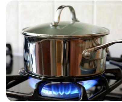
A metal pan is smooth and shiny.