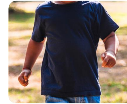
A cotton T-shirt is soft and stretchy.