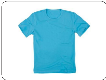
This T-shirt is made from fabric.