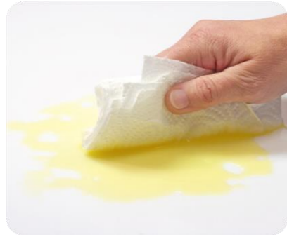
A paper kitchen towel is soft and absorbent.

A property is a quality that a material has. Materials can be described by their properties, such as hard, soft, stretchy, bendy, transparent and waterproof. Materials have different properties, which make them suitable for making different objects.