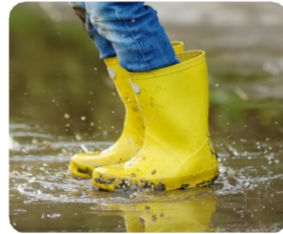
Rubber wellies are waterproof and bendy.