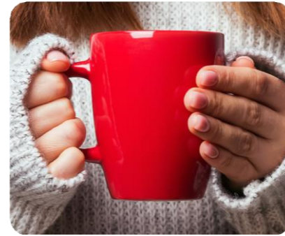
A ceramic mug is hard and waterproof.